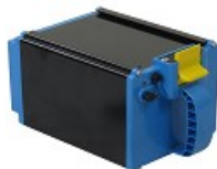
Li-ion battery Pro series 29V/12Ah