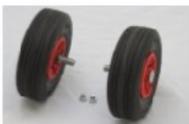
Support wheels, full foam puncture proof