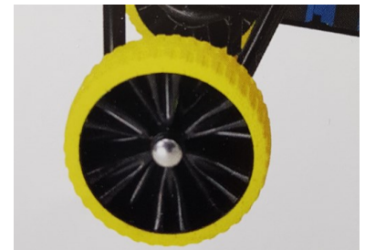
Optional set of support wheels Flex Lite 3.00-4 puncture proof