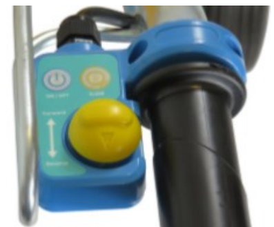
Joystick with protective bracket