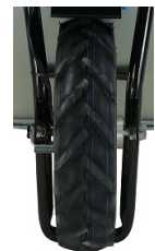
Traction tire with Chevron profile