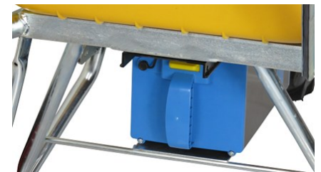
Easily exchangeable battery, supplied complete with charger