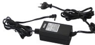
Quick charger 24V/2.5Ah 100-240V AC 50-60HZ 24VDC/2.5A