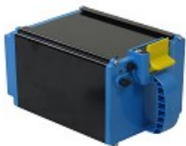
AGM lead battery 24V/10Ah