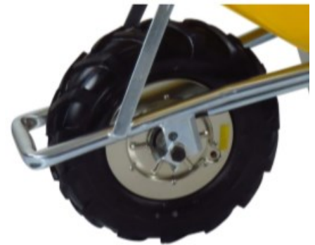
Standard supplied with traction wheel PAC-free and REACH certified